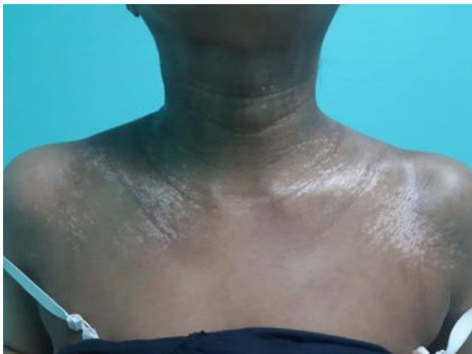
Figure 1. Salt-and-pepper appearance is skin manifestation characterized by hyperpigmentation and hypopigmentation in the sclerotic area.

On the recent physical examination, the Glasgow Coma Scale (GCS)15, blood pressure 110/70 mmHg, heart rate 90 times/minute, respiratory rate 20 times/minute, and axilla temperature of 37°C. Oxygen saturation was 96% in free air. Wong-Baker Pain Rating Scale was 0. The skin seemed to be tightening on the face, brachialis, around the clavicle, and the axilla. Other physical findings are unremarkable. The thoracal examination was in normal limit, except the auscultation revealed rhonchi from both sides of basal