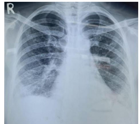
Figure 3. The chest x-ray showed bilateral parenchymal infiltrates in the lower lobes, indicating interstitial lung disease.

The onset of the disease ranges around the age of 35 to 50 years with higher frequency on women at a ratio of 3-7:1 compared to men, as some other autoimmune diseases affect women more frequently. 4,6,10,13 The main cause of scleroderma consists of genetic and environmental factors which include ingesting food suspected to contain high level of L-tryptophan, having occupation susceptible to contact with materials containing trichloroethylene, xylene, poly-vinyl chloride, and silicate powder, as a reaction to medications such as bleomycin, paclitaxel, docetaxel and cocaine, and radiation from radiotherapy treatment. 2 Our patient is 40 years old but has been diagnosed with scleroderma for 5 years. The risk factor of this disease is genetic since the patient’s occupation as a housewife and no past medical history of